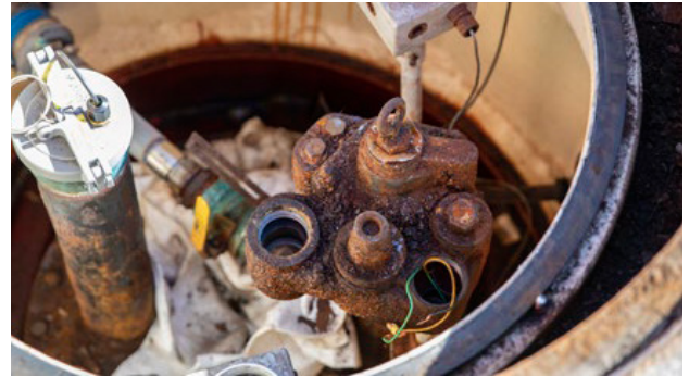
Aggressive corrosion of this STP equipment cut short its useful life span